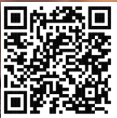
Giving QR Code