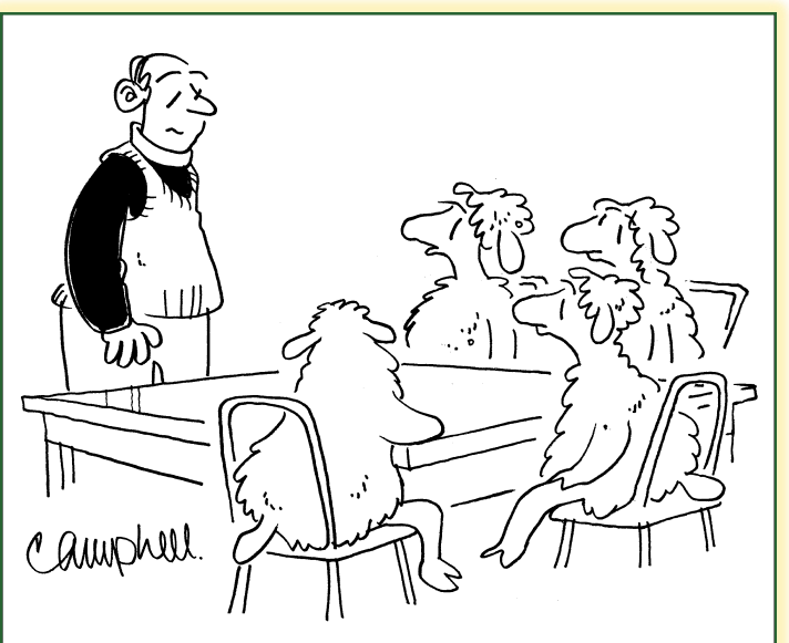
"Your sign said, 'Join the flock at Sunday school.' "

Jer 23:1-6; Eph 2:13-18; Mk 6:30-34 Sgs 3:1-4b or 2 Cor 5:14-17; Jn 20:1-2, 11-18 Monday Tuesday Mi 7:14-15, 18-20; Mt 12:46-50 Wednesday Jer 1:1, 4-10; Mt 13:1-9 Thursday 2 Cor 4:7-15; Mt 20:20-28 Friday Jer 3:14-17; Mt 13:18-23 Saturday Jer 7:1-11; Mt 13:24-30 17th Sunday in Ordinary Time 2 Kgs 4:42-44; Eph 4:1-6; Jn 6:1-15